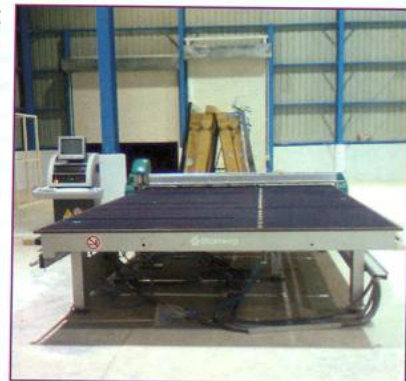
Glass Cutting Machine