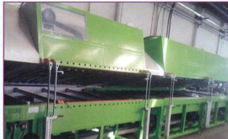
Screen Printing Line