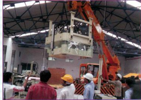
End Capsulation Installation