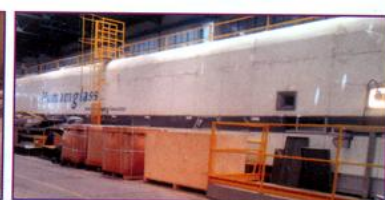
IV Furnace Installation