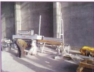
Single Edger Installation