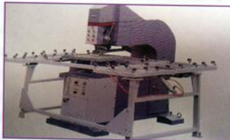
Glass Drill Machine