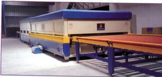
North Glass Tempering Furnace