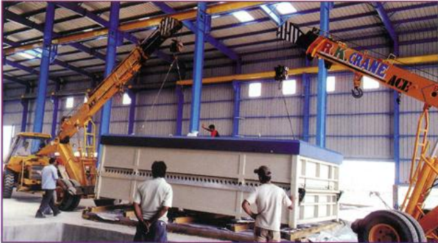
Tempering furnace Installation